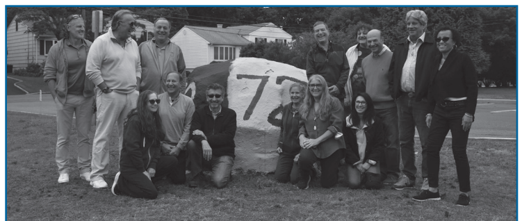
RNHS class of '72 painted the rock to celebrate their 50th reunion